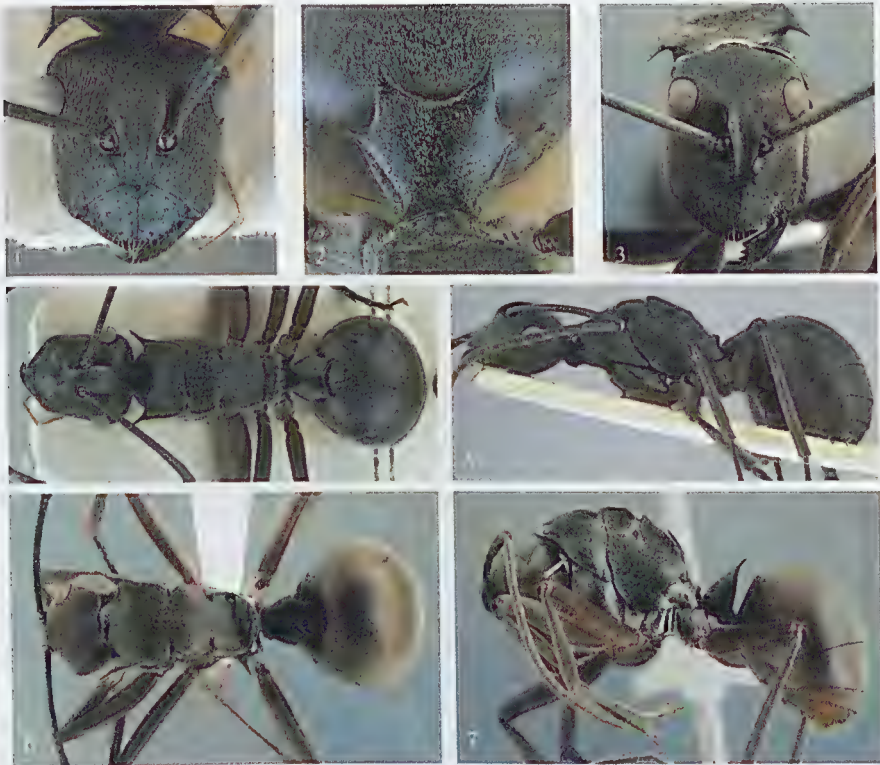
Figs 1-7. Polyrhachis spp. (1-2, 4-5) P. conops Emery (syntype): (1) head in full face view; (2) petiole in frontal view; (4) dorsal view; (5) lateral view. (3, 6-7) P. gazelle sp. n. (holotype): (3) head in full face view; (6) dorsal view; (7) lateral view. Not to scale.